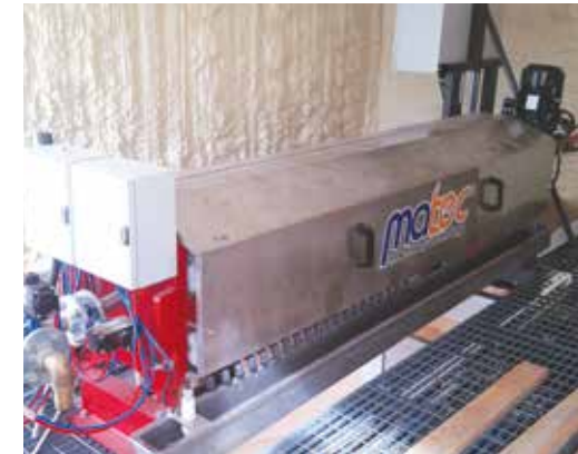
CWR Filter Press in South Carolina