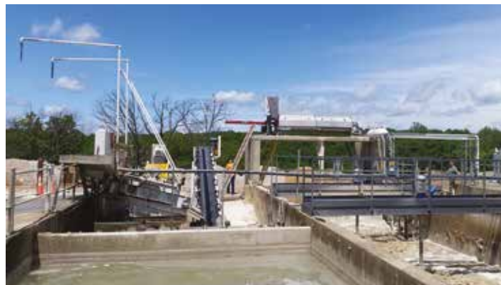
CWR plant in Missouri