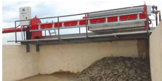
Plant in Colorado

MATEC has a technical office with 5 engineers dedicated to blueprint design, project engineering and the providing of different platforms, 1 dedicated engineer during installation, 10 technicians for the plant assembling and start-up, and for the after-sale assistance within 24/48 hours