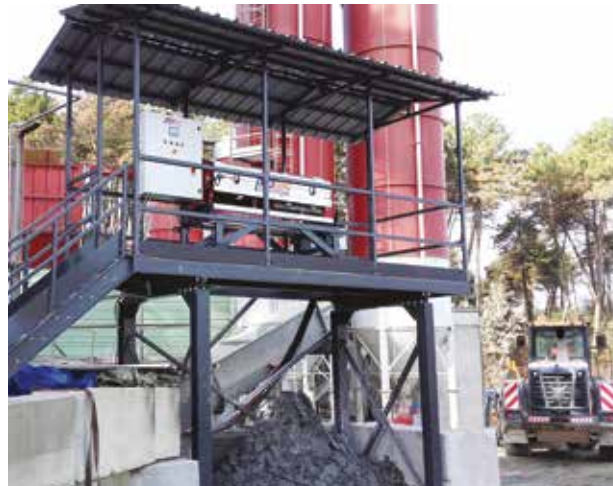
Matec CWR plant in Italy