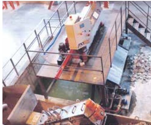
CWR plant in Russia

Thus we can guarantee cutting down disposal costs, also thanks to the production of dry cakes easy to shovel and move