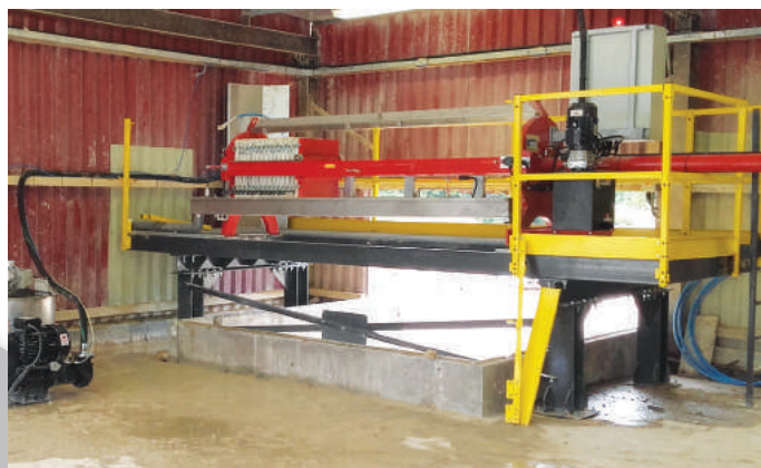
500x500 Matec plant in England

FROM 400x400 TO 2000x2000 PLATE SIZE FROM 3 TO 220 PLATES OVER 150 TPH