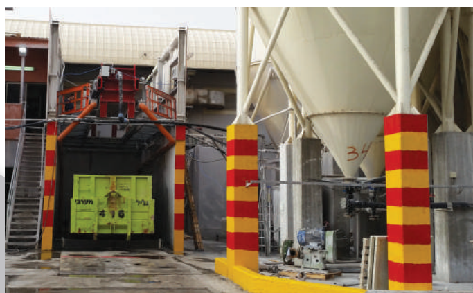
1000x1000 - 40 plates filterpress machines, Israel

Customize your filter press system to your needs.