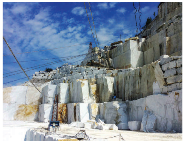
View of Carrara quarries

In marble, granite and stone working, both at quarries and at stone factories, water has many applications. From stone-cutting to polishing, water is necessary to avoid tools' overheating and to reduce by-product dust from various processes. Then water must be treated to be re-use in closed production cycle.